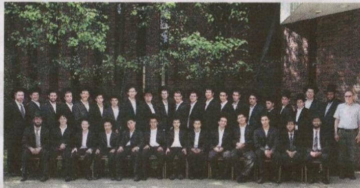
Bachurim and rebbeim of Mesivta of Toledo

This past year, the Mesivta of Toledo, formerly of Toledo, Ohio, relocated to West Bloomfield, opening up promise for this suburb to develop into a large Torah community. Let's take a look at these exciting developments.